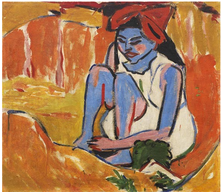
Ernst Ludwig Kirchner Das blaue Mädchen in der Sonne, 1910 Oil on canvas, 82.5 x 92.5 cm Estimate: € 2,000,000 – 3,000,000

Ernst Ludwig Kirchner ’s “Das blaue Mädchen in der Sonne“ is a key work in the one-of-a-kind collection and a masterpiece of Expressionism. Today paintings of this quality are almost exclusively museum-owned. Now this solitaire in the artist’s creation, which is particularly captivating for the reduced and powerful colors, might be available for the estimate of € 2,000,000-3,000,000.