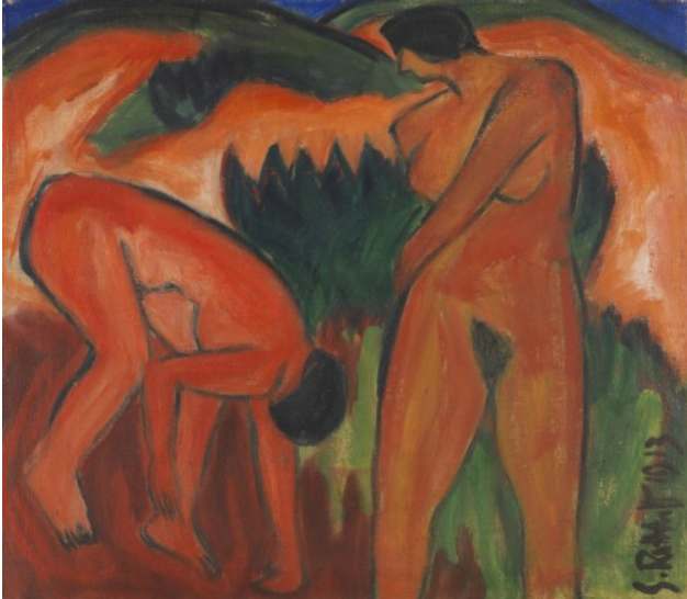
Karl Schmidt-Rottluff Rote Düne, 1913 Oil on canvas, 65 x 74,5 cm Estimate: € 800,000 – 1,200,000

Other major Kirchner works in the collection are, along with the “Hockende“ (estimate: € 700,000-900,000), one of the few preserved sculptures by the artist and an absolute rarity on the international art market, the painting “Fehmarnküste mit Leuchtturm“ from 1913 (estimate: € 700,000-900,000) and the 1910 oil painting “Im Wald“ (estimate: € 600,000-800,000). While the first is a document from the important creative period in Berlin, the latter is a prime example of the accomplished “Brücke“ style, a highlight from the artist group’s important time at the Moritzburg Ponds.