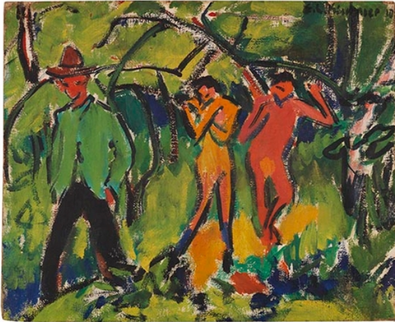
Ernst Ludwig Kirchner. Im Wald, 1910. Oil on canvas Estimate price: € 400,000 - 600,000

* Heinrich Campendonk. Landschaft mit Tieren, around 1913. Oil on cardboard, laid on fiberboard and mounted on the stretcher.