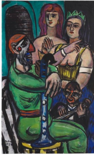
Max Beckmann Großer Clown mit Frauen und kleiner Clown, 1950. Sold for: € 3,678,000