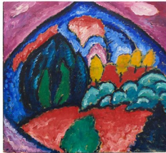
Alexej von Jawlensky Berge in Oberstdorf, 1912. Sold for: € 1,076,500