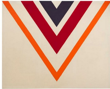
Kenneth Noland Via Media (Suddenly), 1963. Sold for: 1,439,500