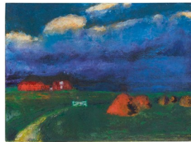
Emil Nolde Landschaft mit Seebüllhof, 1930. Sold for: € 914,400