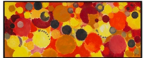
Ernst Wilhelm Nay Sonnenzirkel, 1956. Sold for: € 889,000