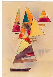
Wassily Kandinsky Friedlich, 1930. Sold for: € 787,400