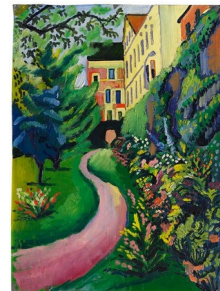
August Macke Unser Garten mit blühenden Rabatten, 1912. Sold for: € 762,000

Image inquiries: Bettina Ktona presse@kettererkunst.de