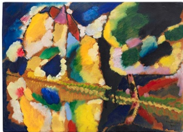
Lot 25 Wassily Kandinsky Villa Seeburg am Staffelsee, 1911. Estimate: € 2.0 million Result: € 5.5 million