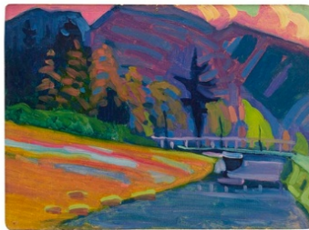
Lot 44 Wassily Kandinsky Bei Oberau, 1908. Estimate: € 500,000 Result: € 645,000