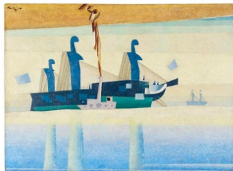
Lot 65 Lyonel Feininger Hulks, 1923. Estimate: € 400,000 Result: € 567,600