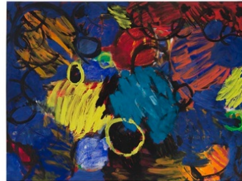
Los 46 Ernst Wilhelm Nay Motion, 1962. Estimate: € 500,000 Result: € 890,100