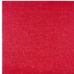
Lot 7 Piero Dorazio Tic-Tac Rosso, 1959/60. Estimate: € 300,000 Result: € 2.6 million