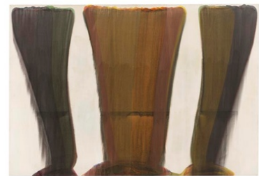
Lot 17 Morris Louis Dalet Chet, 1958. Estimate: € 400,000 Result: € 619,200