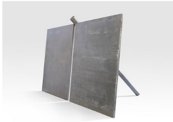
Lot 34 Richard Serra No. 1. 1969 Estimate: € 600,000 Result: € 903,000