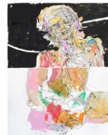
Lot 37 Georg Baselitz Enddesign. 2011. Estimate € 550,000 Result: € 967,500