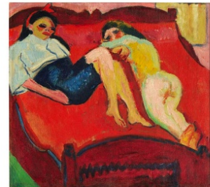
Lot 59 Hermann Max Pechstein Zwei liegende Mädchen, 1910 Estimate € 1.5 million Result: € 1.9 million