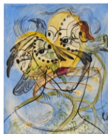
Lot 5 Francis Picabia Manucode, 1929. Estimate: € 1.0 million Result: 1.4 million