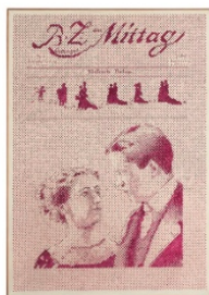
Lot 41 Sigmar Polke B.Z. am Mittag, 1965 Estimate: € 1.2 million Result: € 1.6 million