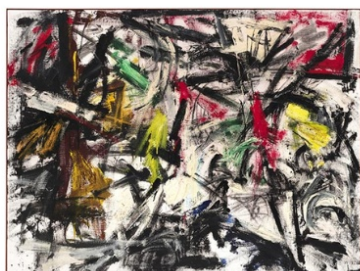
Lot 10 Emilio Vedova Tensione, N 4 V. 1959. Estimate: € 700,000 Result: € 967,500