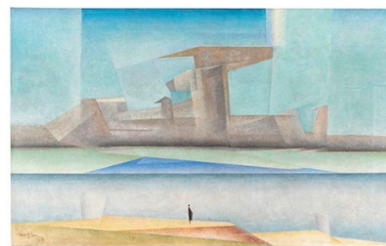
Lot 20 Lyonel Feininger Die Insel, 1923. Estimate: € 700,000 Result: € 903,000