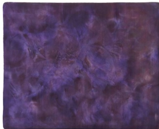
Los 48 Gotthard Graubner Lapilli. 1995. Estimate: € 400,000 Result: € 774,000